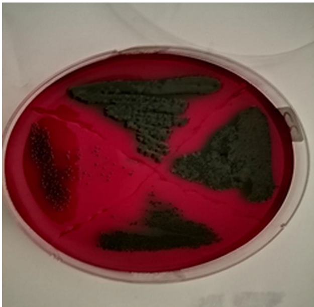
Fig. 1 Biofilm formation of Escherichia coli and Salmonella enterica on Congo red agar